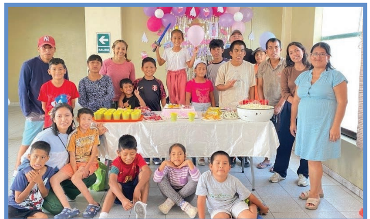
Above (from top, L-R): These boys love Hogar de Esperanza's playground; One girl enjoys a workshop on marinera, Peru's national dance; A mission team from Lancaster Bible College leads a vacation Bible school; On Easter, HdE celebrated Jesus's resurrection; Birthdays are a time to celebrate each child.